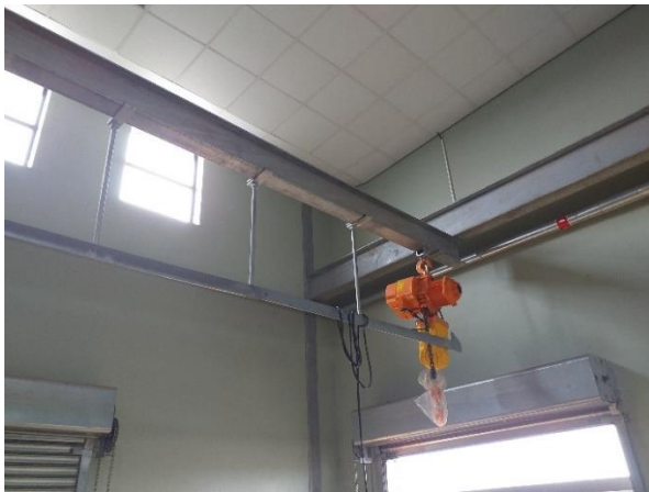
Figure 2 Current Bleeding Rail Setup