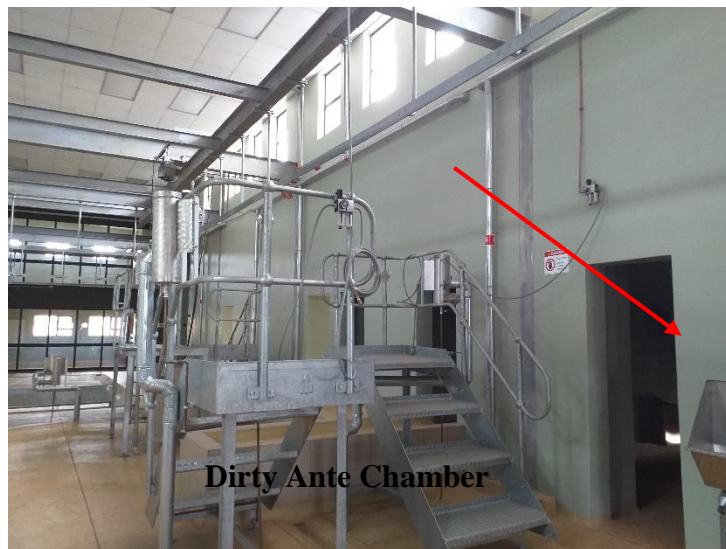
Figure 8 Ante Chamber Dirty Side

Currently there is no ante Chambers in the abattoir facility. The design plans did provision for an Ante Chamber however, there is no clear characterisation of the rooms with no doors or labelling present. This can be seen in Figure 8 below.