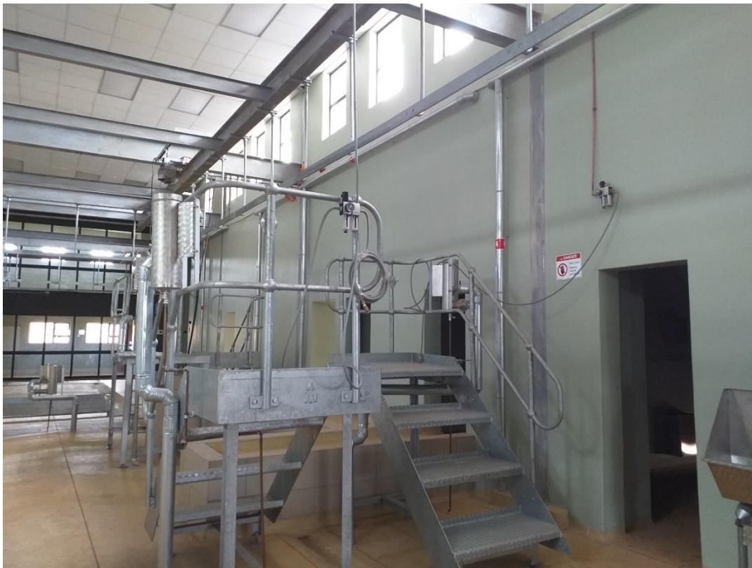
Figure 3 Dressing Rails

All rails after the Bleeding area have varying heights (between 2.6m and 2.8m) in relation to the ground. The sheep line meets the requirement for height clearance. The beef rails however, do not meet VPH requirements of a minimum clearance of 3.4m. The rails are attached to I Beams for support. The fittings itself can also be swapped and lifted to attach onto the top lip of the I-beam. Each Rod that attaches to the Dressing line can also be cut and shortened in order to allow for extra clearance. As a worst-case scenario to ensure that the height clearance is achieved, the I-beam can also be raised by fixing it to the top of the Structural beam and not the Bottom. The picture can be seen below as an indication of the existing setup. The total length of all the rails that need to be raised extend from the Bleeding area throughout the Abattoir into the refrigeration rooms.