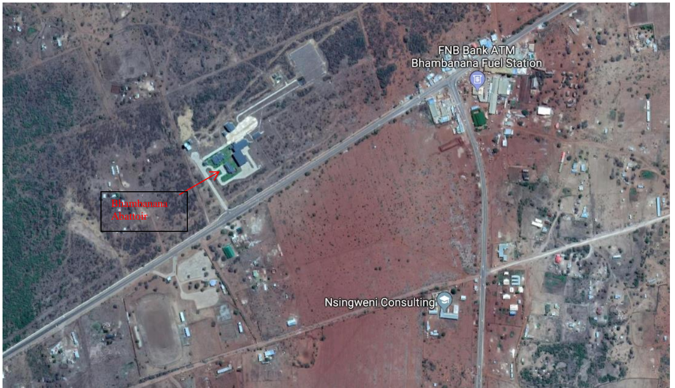
Figure 1: Bhambanana Abattoir Location