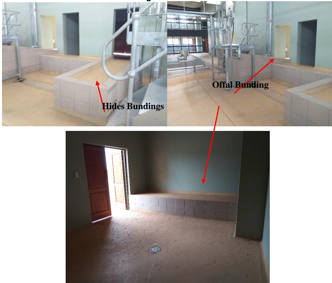
Figure 7 Offal and Hide Bundings