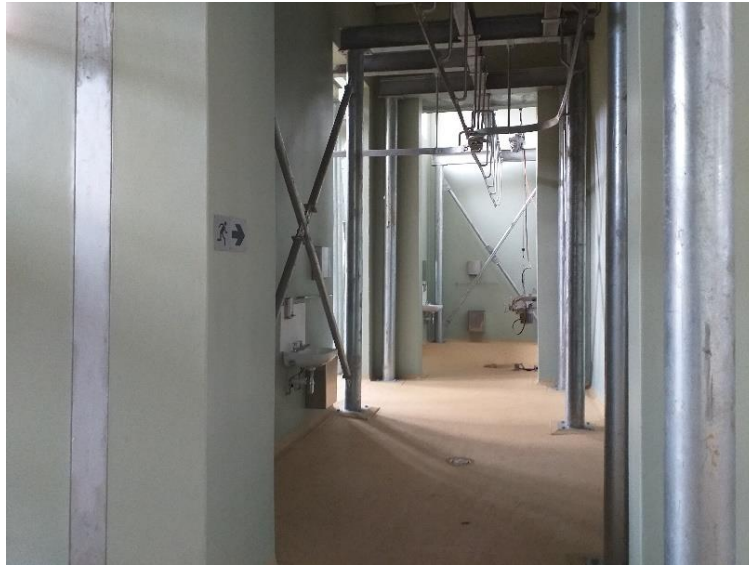
Figure 9 Ante Chamber clean Side

A clean side Antechamber for the abattoir is also not specifically identified. With this in mind the recommendation for the clean side ante chamber can be positioned in the area as seen in Figure 9 above. For the clean side it is not necessary for a door to be installed due to the fact that there is an existing door that leads from the office facility into the abattoir floor. All sundry equipment relating to the Ante Chamber such as; Apron washer, boot washer, apron rack, boot rack, hand wash basin etc will have to be installed into the room together with all related plumbing and drain fittings. The existing wash basins are not knee operated and will have to be removed and a knee operated wash basin will have to be installed.