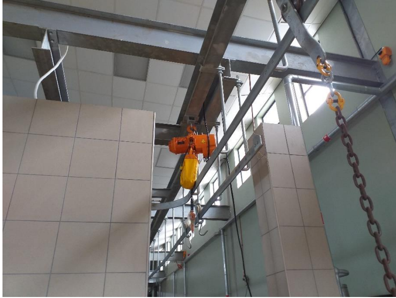
Figure 6 Wall between the Bleeding and Dressing Area

As it can be seen in Figure 6, the wall passage between the bleeding area and the dressing area is too narrow. Regulations state that the rails clearance from columns or doorways must be at least 700mm. The wall passage will therefore need to be widened in order to allow clearance of 700mm on either side. The wall is a standard double brick wall. The right hand side pillar has plumbing and drains attached to the pillar. This will have to be shifted if necessary to a suitable location along the wall in order to maintain the 700mm clearance from the rail.